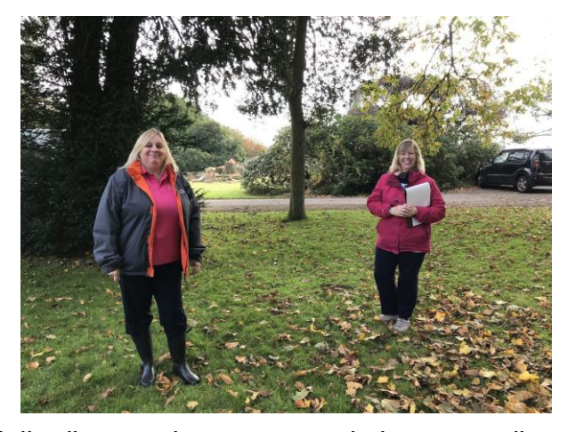
Socially-distanced assessor and placement discussion